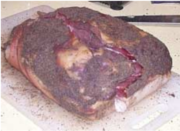
Cured and aged, bone in