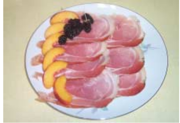
Cured and aged, boneless